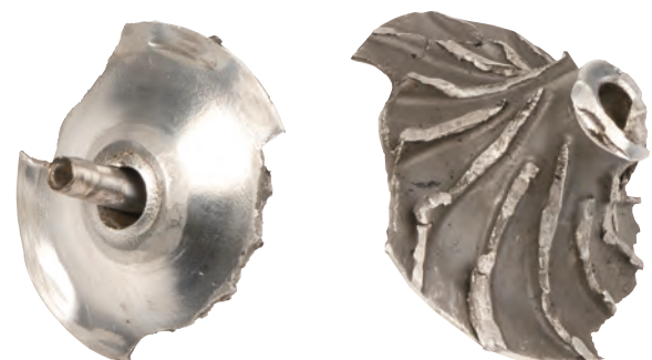
Complete component failure